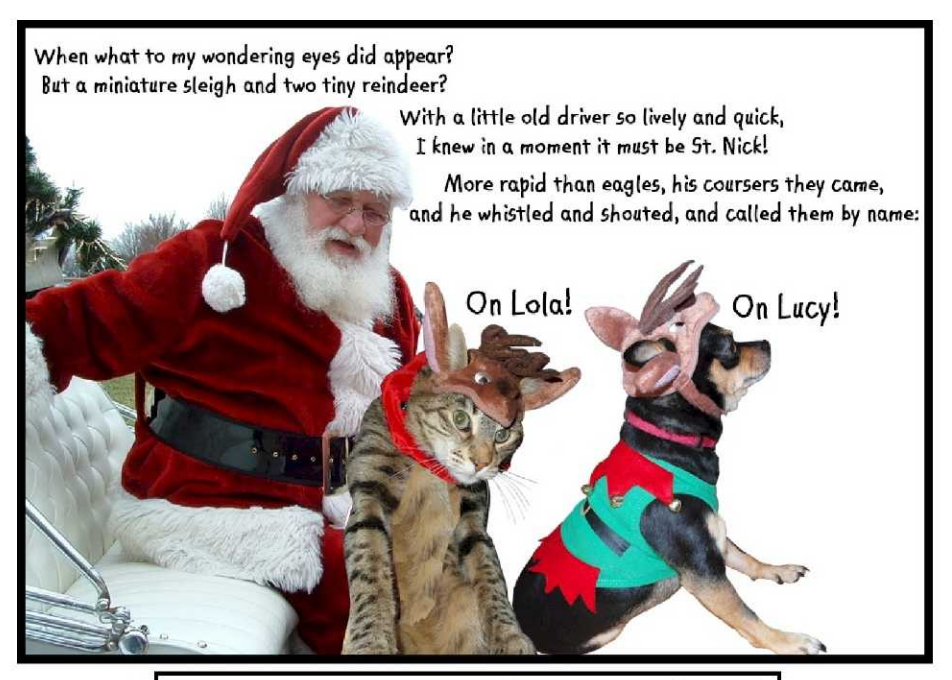
Happy Christmas to all, and to all a good night!