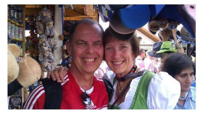
We had a great time at Oktoberfest, but were really ready to get home to see the animals! We followed the German Oktoberfest up with one in Helen, Georgia! It gave us another opportunity to wear our new German garb.

Our longest trip of the year was split between Ireland and Germany. We had already planned to go to Oktoberfest in Munich when our friends announced their plans to marry in Ireland. The wedding was in an old temple on a cliff overlooking the ocean.