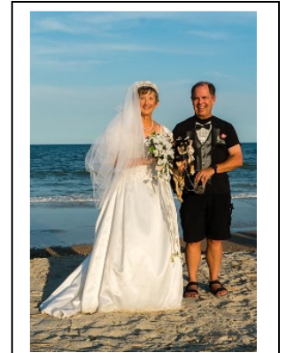
We celebrated our 30 th anniversary with a mock wedding on the beach!

Hope you've had a wonderful year as well and that you made lots of memories!